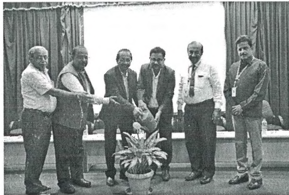
Inauguration of the function by watering the plant